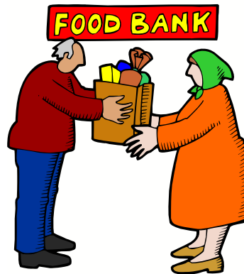
Food Banks are great groups to Partner with!

After you have made your selection, notify the group in person if possible, by phone otherwise and inform them of your intention to honor that group. Ask them when they might have a date open that they could attend your lodge for a honors night, with dinner. Ask them also, what time would be most convenient for them. Be sure to get some kind of number of people that will be attending on behalf of the group. Once you have this kind of information form a planning team to put the details together. Plan your dinner, we have included some ideas for you on your planning sheet. When you have your team together make sure they confirm the details of the event with the group that you are recognizing by sending written notice to them with all of the pertinent information. You might want to start by showing your guests around the lodge, and if you have a brother available who is knowledgeable about the history of your lodge have