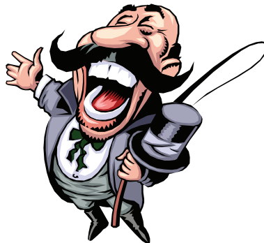
One night when mirth takes center stage!

Here are a few more, feel free to use them if you like.