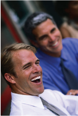
Everybody needs to lighten up now and then!

The concept for this program is very similar in nature to the program for Story Night and as a matter of fact utilizes the same style of procedure.